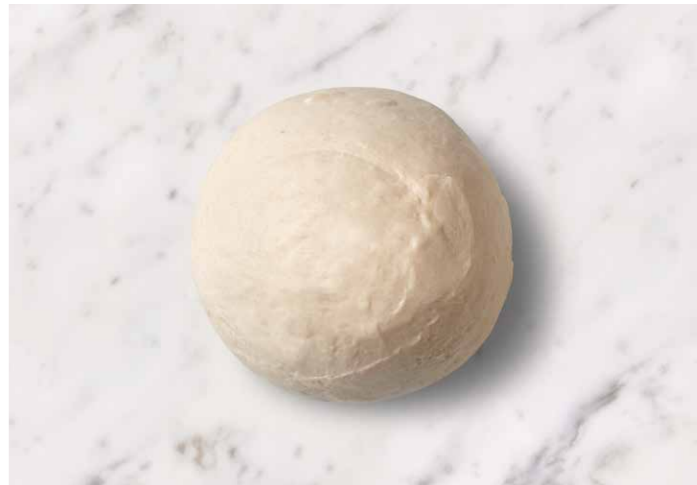
MISS BAGEL PIZZA DOUGH Pizza dough Tipo00 for 1 pizza - Easy and simple!

We didn't think we would be producing pizza dough when we started in 2000. However, due to our bagel quality, our range took a twist in 2023 when a large pizza chain wanted us to produce pizza dough for their restaurants. This means that today we are rapidly expanding our raw dough production. Our precise dosage ensures uniform portion-packed dough for 1 pizza, regardless of whether it is for professional use or the pizza oven at home. The raw dough is delivered frozen to preserve the gluten structure of the dough, ensure the correct rising process before baking and reduce food waste.