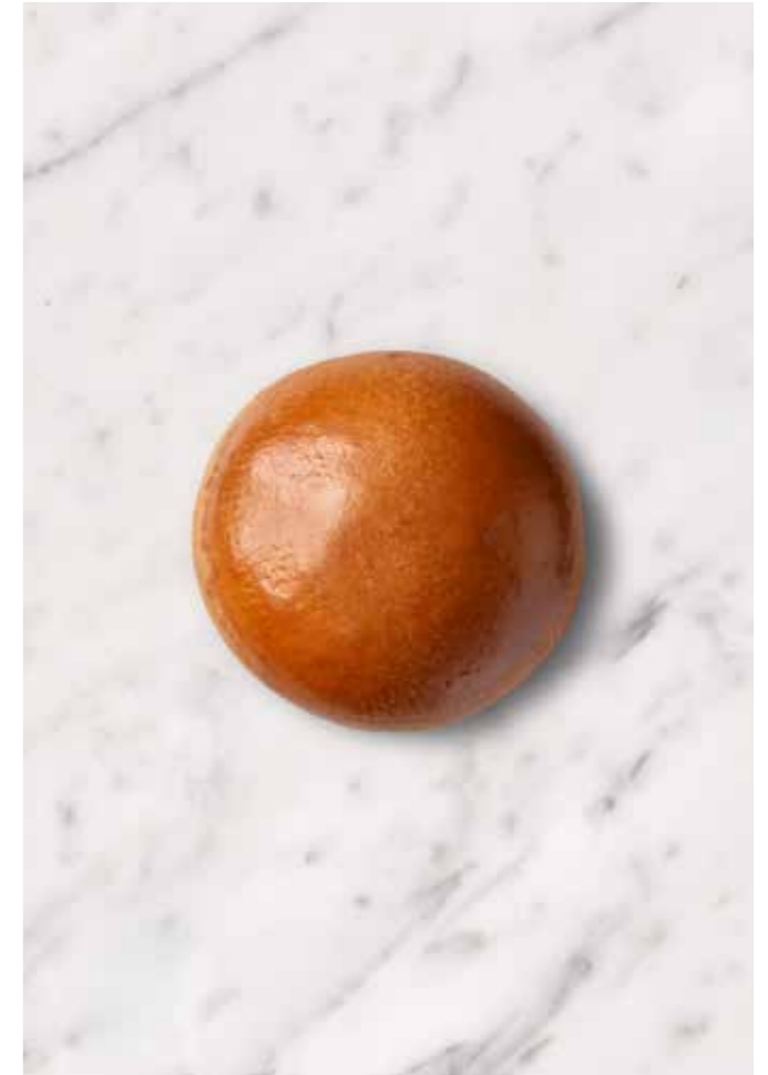
MISS BAGEL BRIOCHE BURGER BUN SLIDER Delicious little slider - Baked with butter!

95g XL (D12-13) 18 pcs. Item no. 408063 Foodservice 80g (D10-11) 24 pcs. Item no. 408083 Foodservice