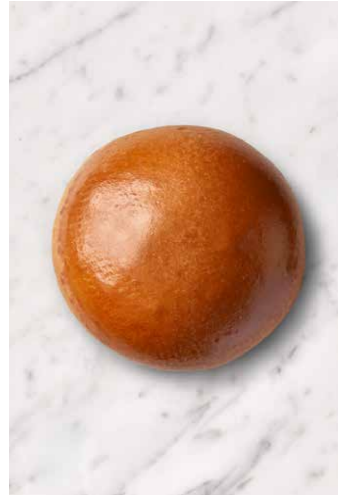
MISS BAGEL BRIOCHE BURGER BUN Our most popular burger bun - Baked with butter!

95g XL (D12-13) 18 pcs. Item no. 407818 Foodservice 80g (D10-11) 24 pcs. Item no. 407801 Foodservice