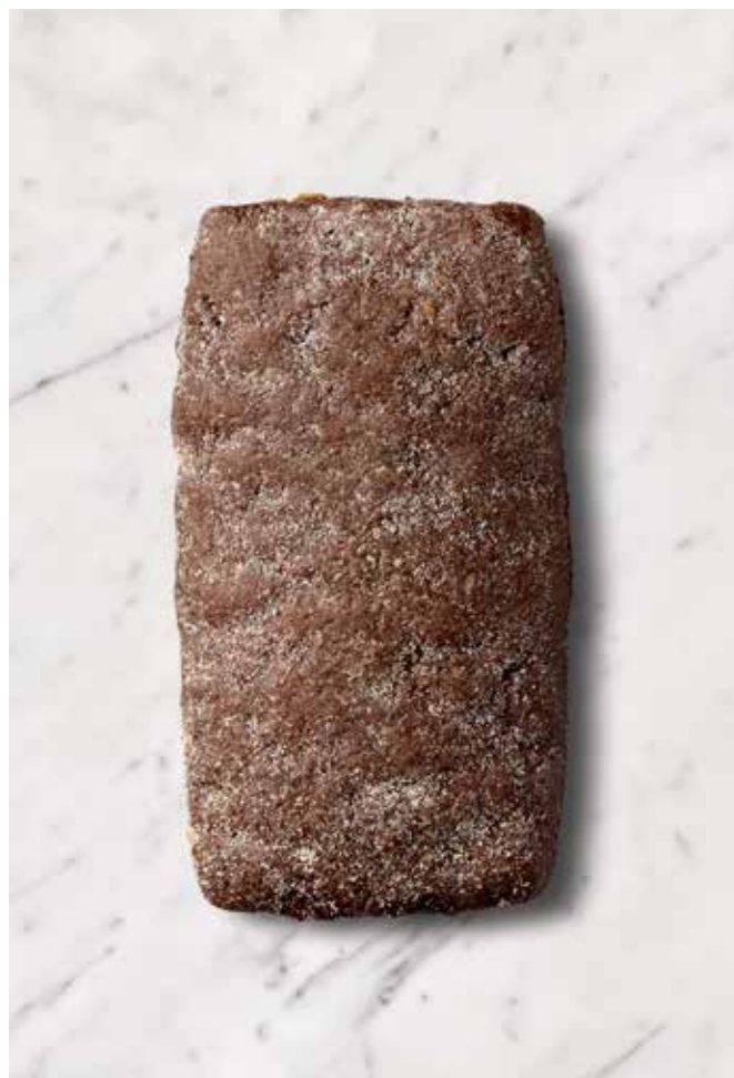
MISS BAGEL CIABATTA DURUM WHOLEMEAL Popular dark sandwich bread

Not everyone knows that Miss bagel also develops and bakes quality sandwich bread. We bake Foccacia and Ciabatta bread of the highest quality for the entire foodservice market. The breads are the starting point for all the special breads we develop together with Nordic chains and groups that have special wishes to enhance their guests' experience. Our sandwich bread is delivered frozen to preserve the structure of the bread "from bakery to table" and to reduce food waste.