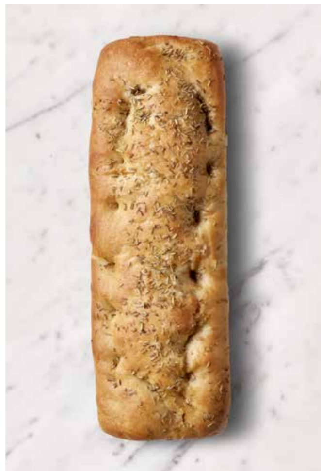
MISS BAGEL FOCCACIA Delicious Foccacia bread in the form of sandwiches and envelope bread

130g 24 pcs. Item no. 40913050 Foodservice