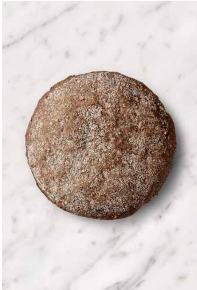
MISS BAGEL BURGER BUN WHOLE GRAIN XL Our whole grain burger bun with a crispy bite and soft crumb

Our burger buns are baked in Denmark with pure ingredients, without the use of preservatives or other additives. Our burger buns are baked with at least 7% real butter. This gives the bread its very own texture, aroma, bite and crumb. You will experience a completely different experience than the traditional burger bun baked with oils and butter aroma. Just try it! All our buns are delivered frozen to preserve the structure of the bread “from bakery to table” and to reduce food waste.