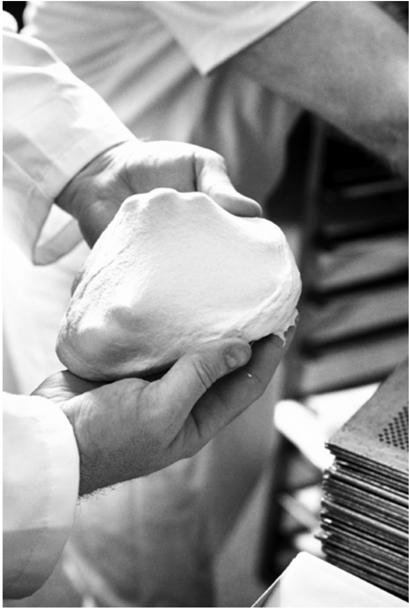
Perfecting the simple