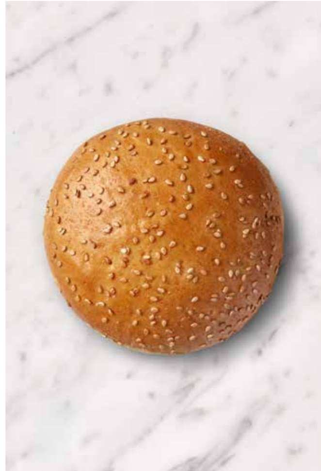
MISS BAGEL BRIOCHE BURGER BUN SESAME Glossy butter-baked burger bun topped with sesame

100g XL (D11-12) 24 pcs. Item no. 40610050 Food-service