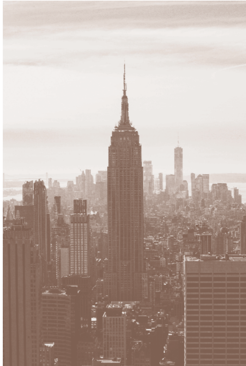
New York - Denmark Since 2000